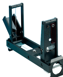
Prismatic Azimuth Device PV 23