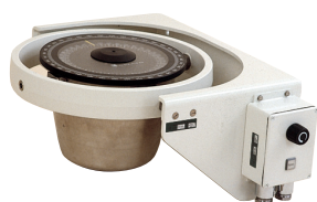
Bearing Repeater Compass with 360° card in bulwark console