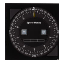
Repeater compass steering, console, bulk-head